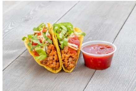
Plant Protein Beef Crumbles